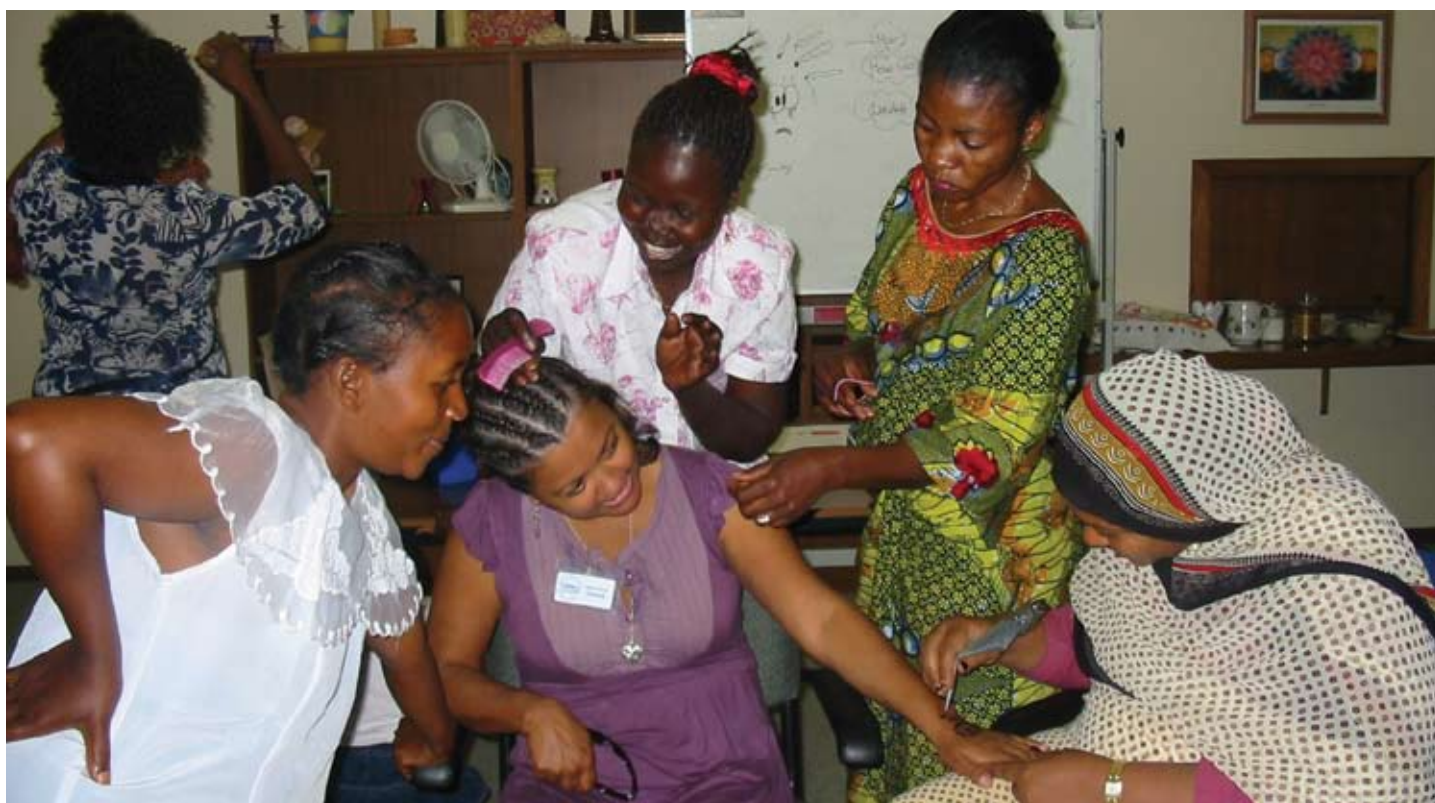
Hair hygiene – including braiding – and henna painting